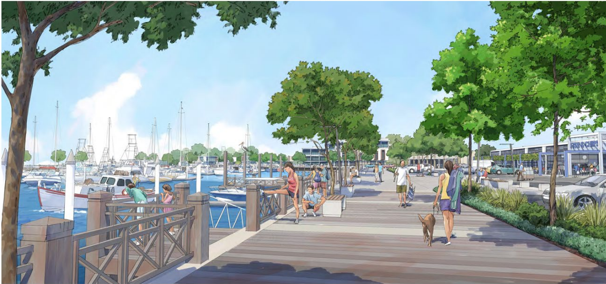
Artist's perspective showing the marina esplanade area looking west